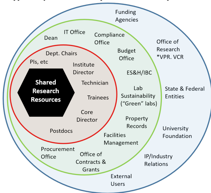
Figure 2: The diagram to the left illustrates the interrelationships of key stakeholders in the SRR ecosystem. This core-centric model depicts three rings that represent three broad but interconnected categories of stakeholders.

SRRs are part of an institution’s research ecosystem whose components need to work together through the exchange of information, financial needs, and human capital.